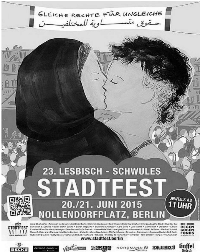
Illustration 1: A poster of the lesbian and gay city festival from the year 2015

“We assume that the Regenbogenfond’s intention, through the putatively more diverse representation of people on the poster, was to reach people and communities who so far were not – or only minimally – represented at the city festival. Had the aforementioned autonomous migrant organizations, groups and associations truly and meaningfully been able to participate in the planning (e.g. of the poster), the city festival might have actually, where possible, gained access to other communities” (MRBB 2015).